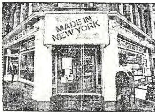
Storefront of the Made in New York Store in Ithaca.

Yes, that's Cookie Chip Chocolates — chocolates with chips of cookie. (Five-ounce bag for $5.95.) Just one of the many unique comestibles you never knew comes from your state. And one of the many unique